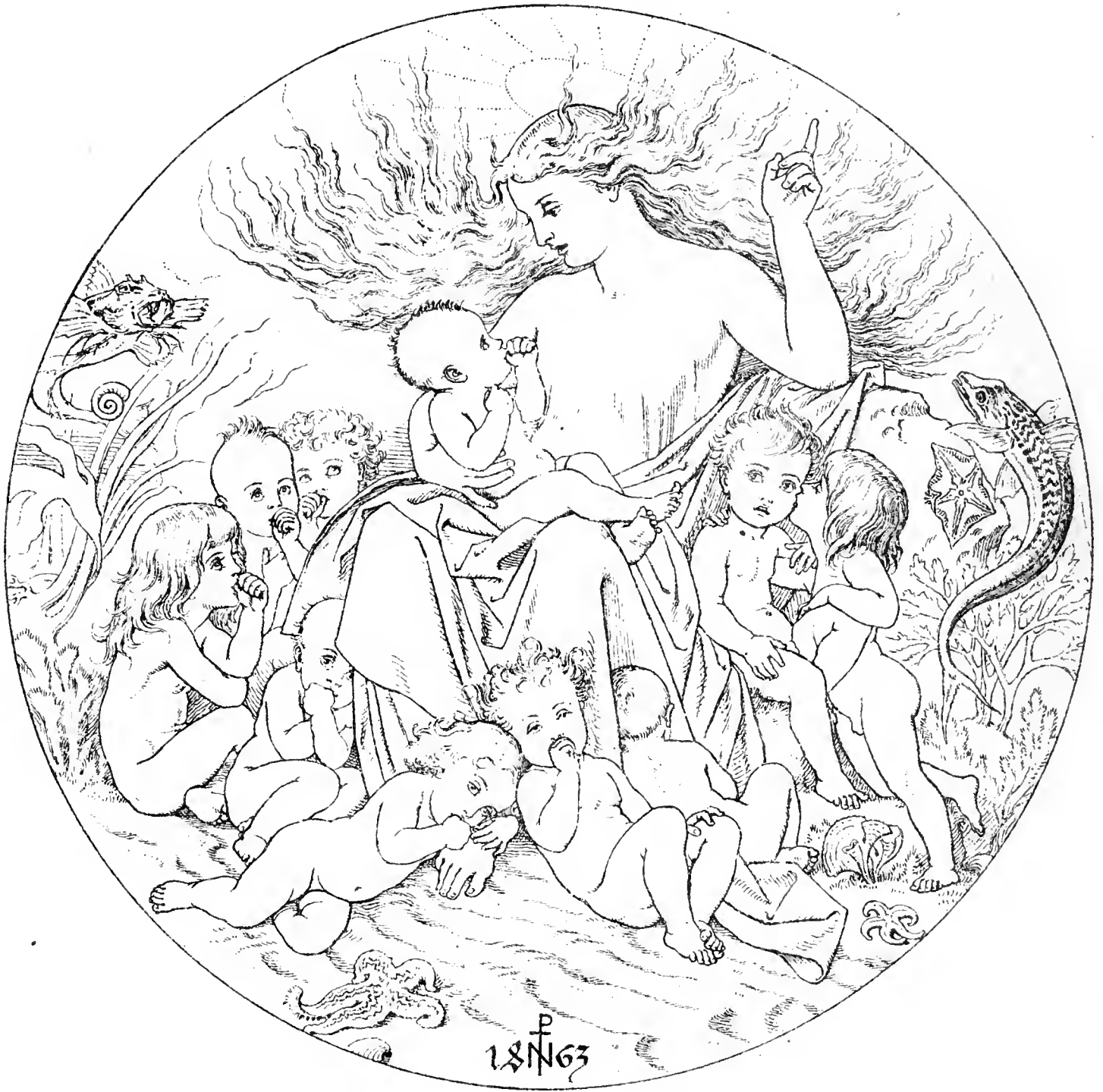
WATER BABIES. — Frounspicer